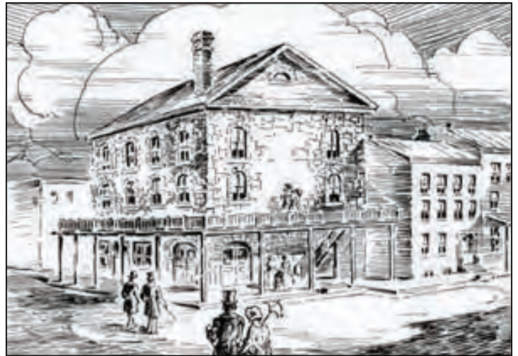
Holy Ghost German Evangelical Church at its 7th & Walnut location, 1840–1858.