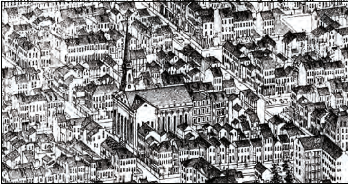
St. Joseph's Church as depicted in Pictorial St. Louis, the Great Metropolis of the Mississippi Valley , 1875.

Christian Scientists. The German Society of Divine Science was established in St. Louis in 1892 and purchased its first building at 18 th and Pestalozzi Streets in 1898. The congregation is now known as First Divine Science Church of St. Louis located at 3617 Wyoming.